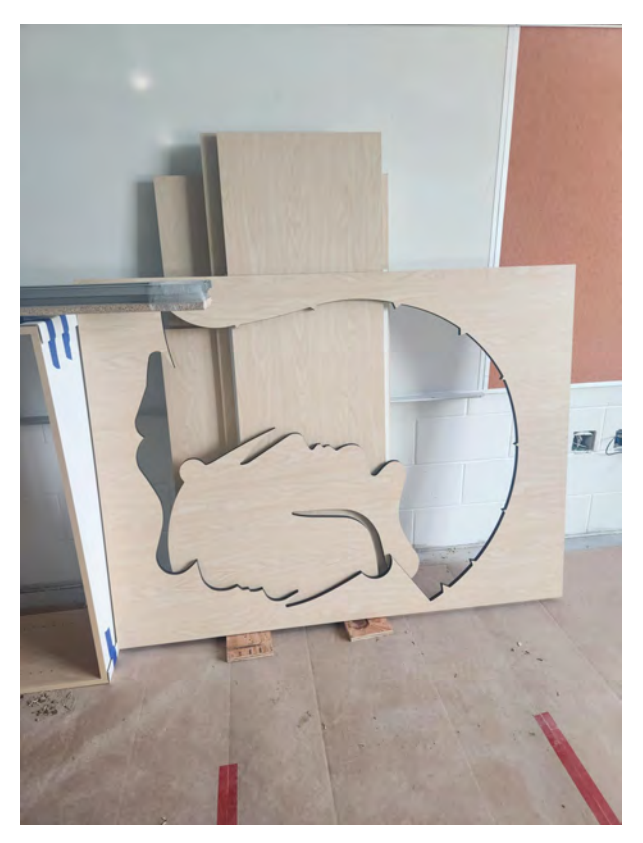
Gladiator head millwork panel prior to install.