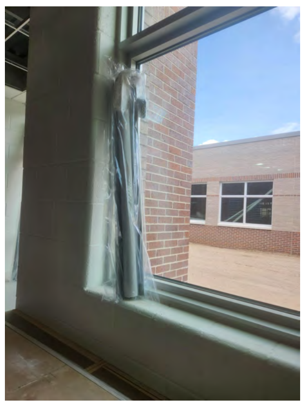
Window shade staged for install.