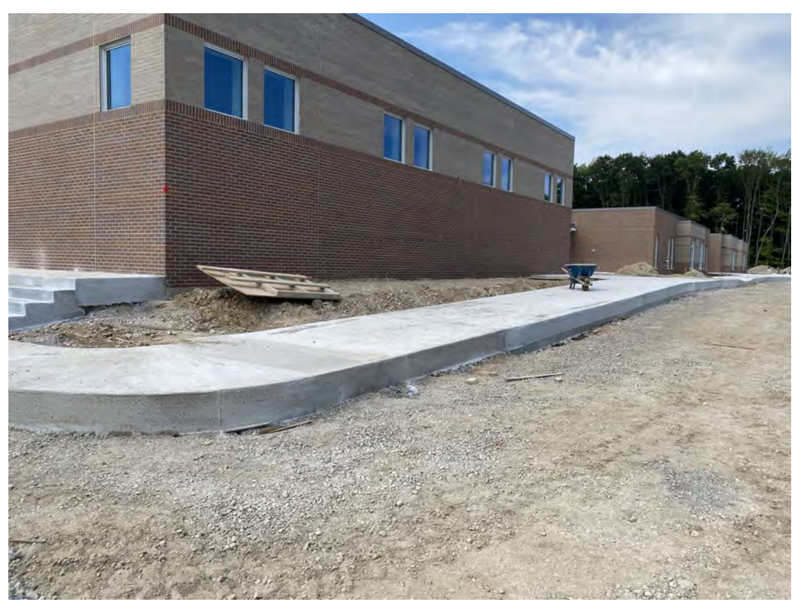
Concrete walks on the south east corner of the building.