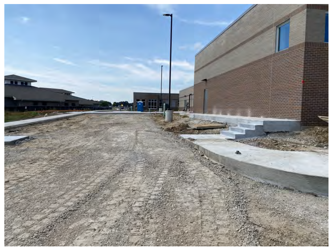
Concrete walks and stairs on the south side of the building.