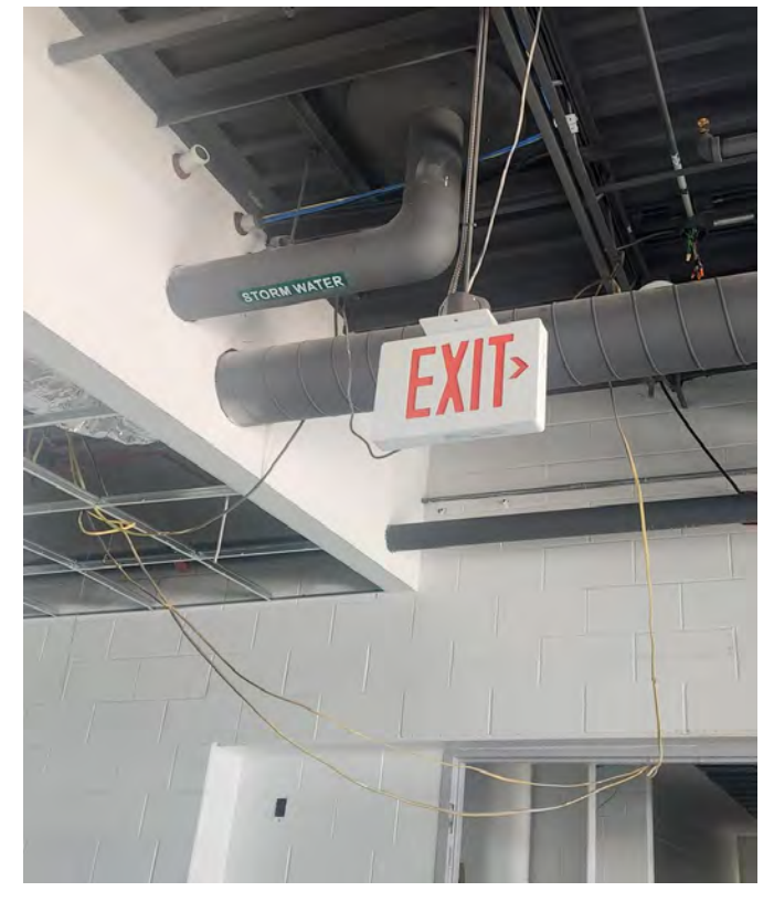
Exit sign installed.