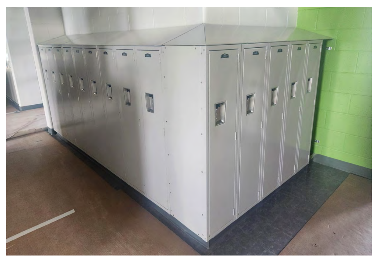
Hall lockers installed with sloped tops and numbers.