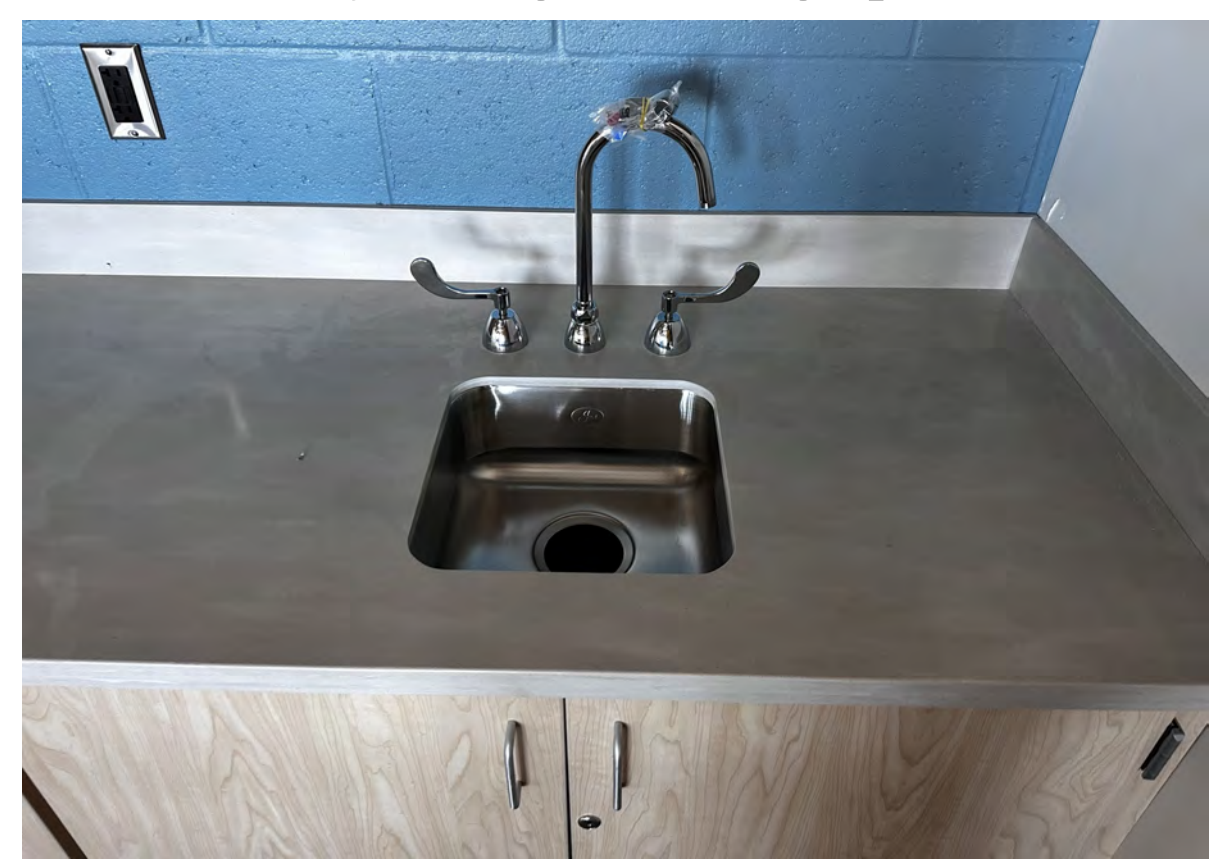
Sink installed in music room.