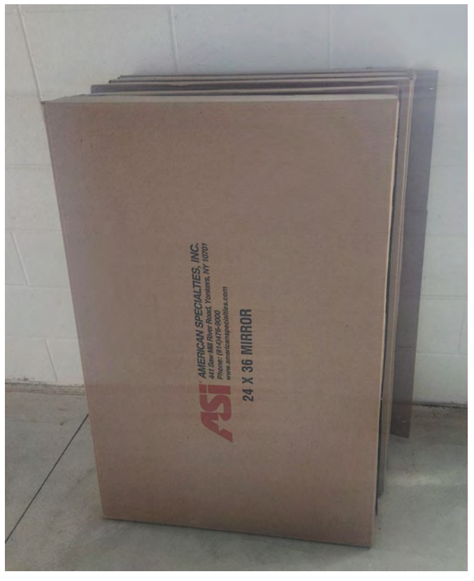
Mirrors on site prior to install.