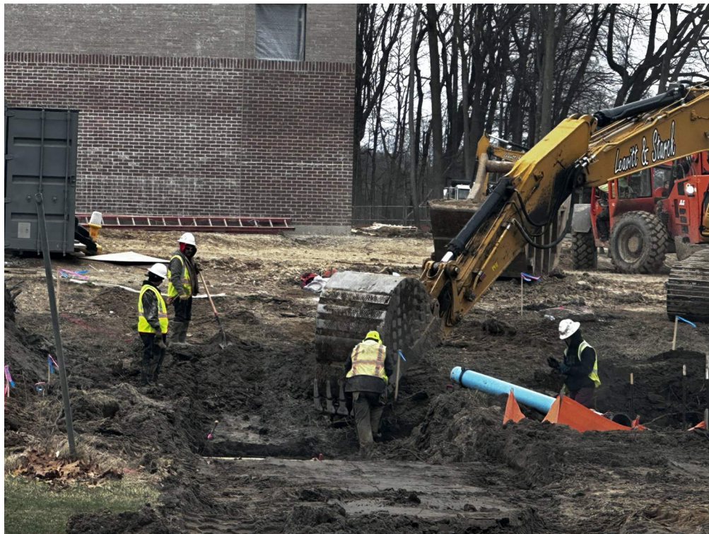
Water main install in progress.