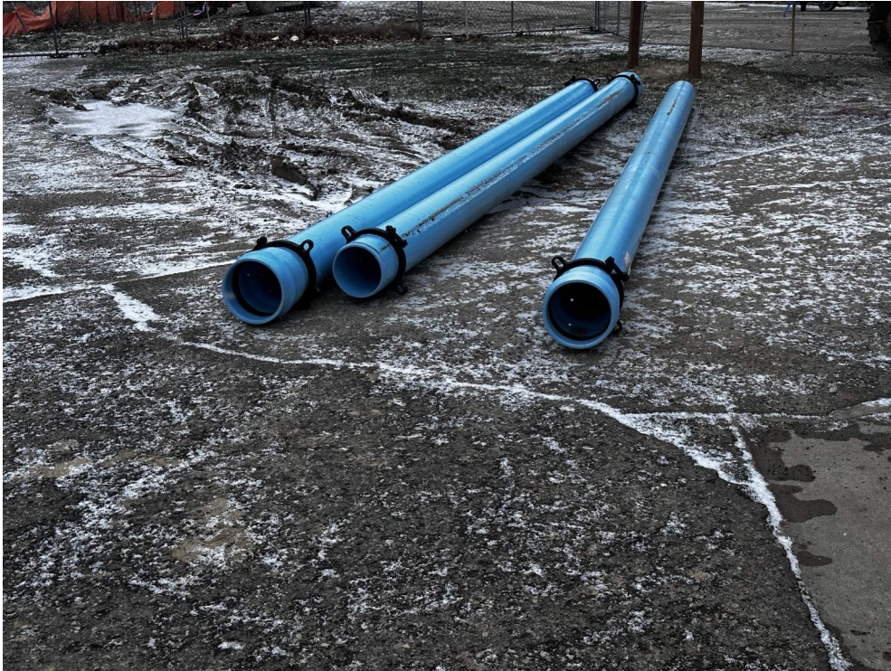
PVC water main material.