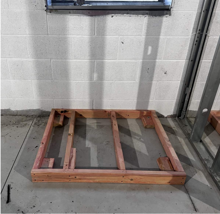
VUV base install in progress.