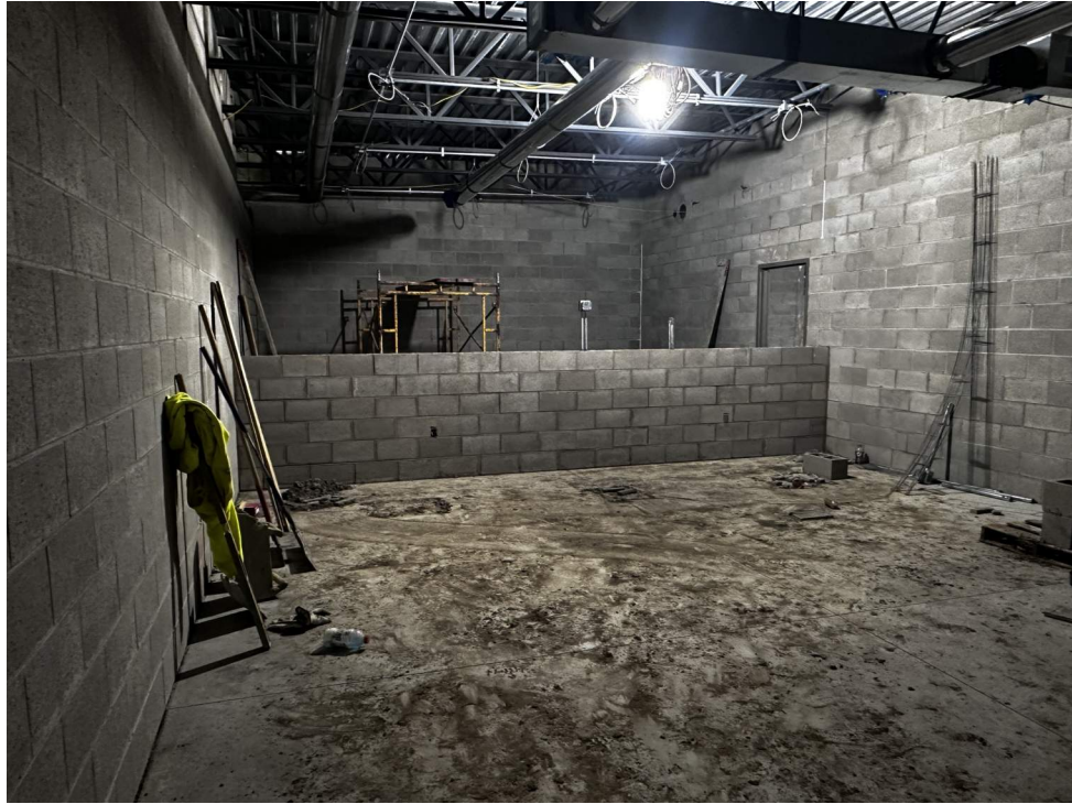
Masonry wall in progress on top of interior slab.