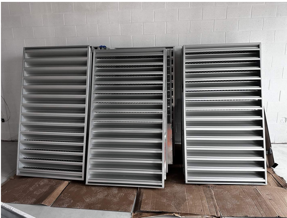
Louvers staged for install.