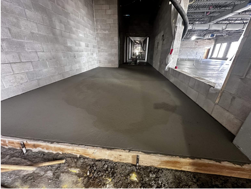
Concrete drying in hallway on east side of building.