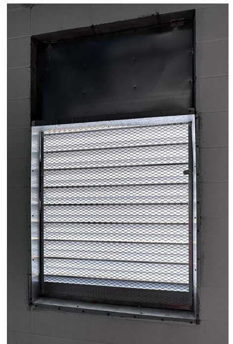
Bird screen install at louver.