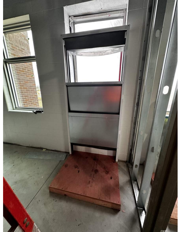
VUV Rear extension and base installed.