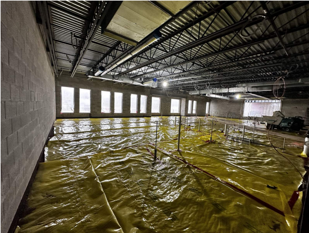
Vapor barrier prep in the main office prior to concrete pour.