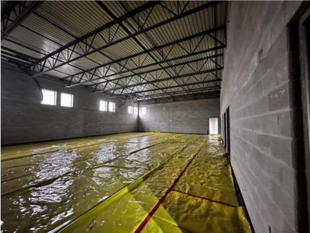
Vapor barrier prep in gym prior to concrete pour.