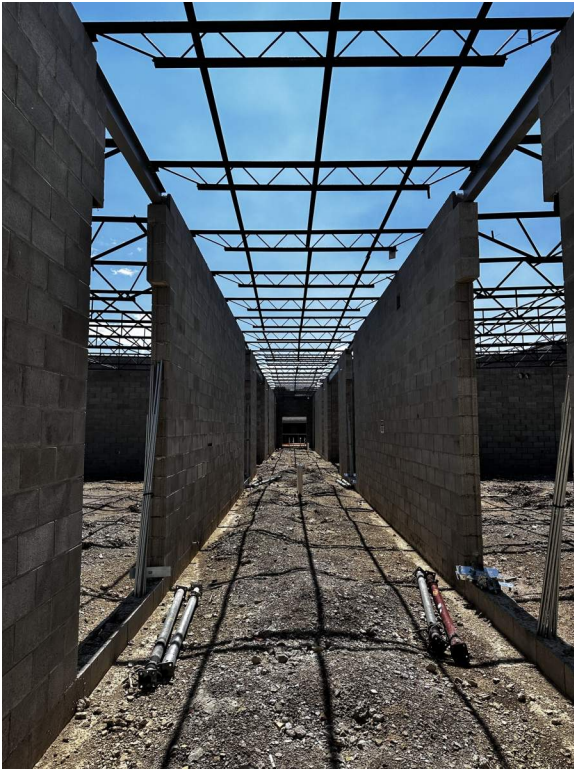
Joists set in a hallway.