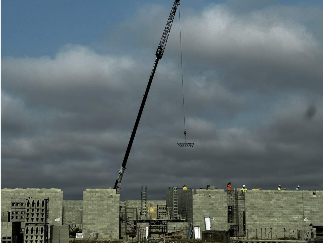
A joist lifted by crane in the north west corner of the building.