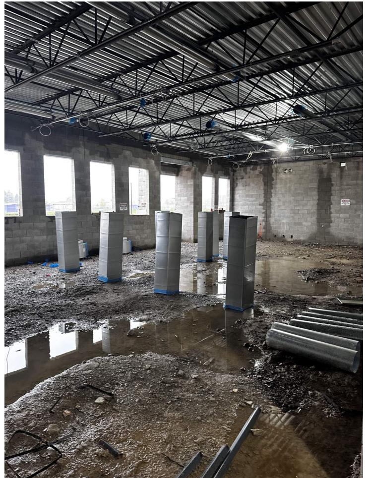
Duct being prepared for install.