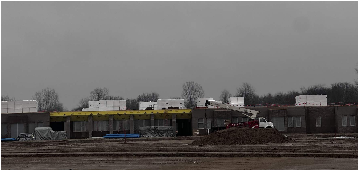
Roofing materials staged on decking.