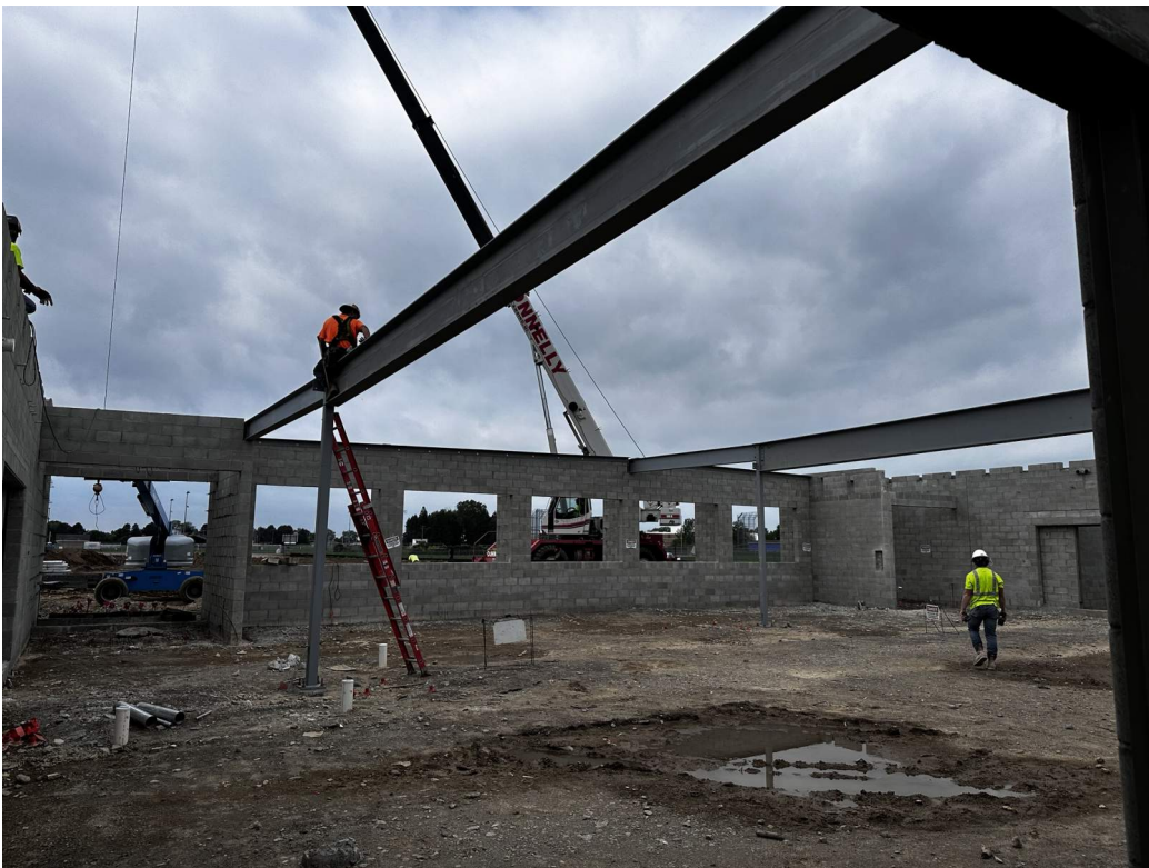
Beams being set in the north west corner of the building.