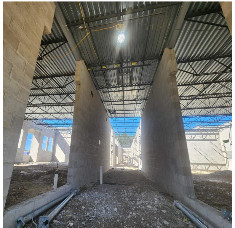
Joists, decking, and temporary lighting in hallway.