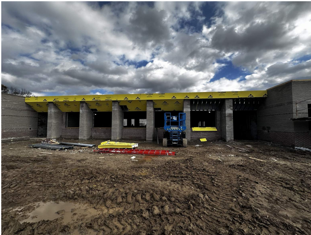
Exterior soffit framing west side of building.