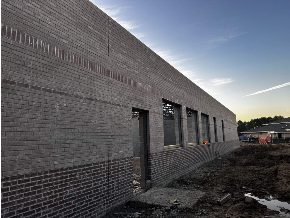
Brick veneer north side of building. Brick in other areas is ongoing.