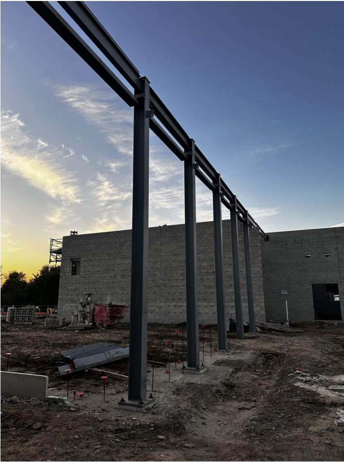
Columns set on south side of the building.